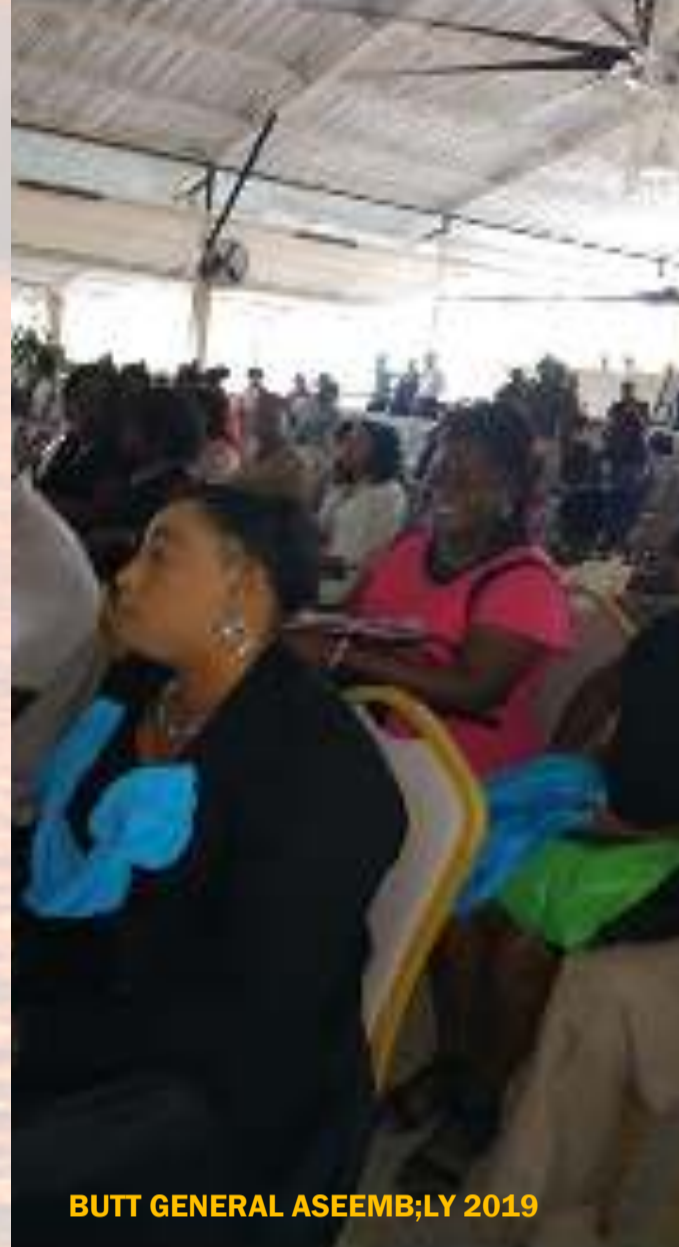
BUTT GENERAL ASEMBLY 2019

The CBF looks to a future marked by greater unity and new leadership, as it goes forward under the 50th anniversary theme, “Reaching Thus Far by Faith: The Journey Continues” . The past 50 years have given abundant evidence that the CBF was established by a move of God. We are assured that though challenges will arise, the future of the Fellowship is secure. “Thanks be to God. To God be the glory”.