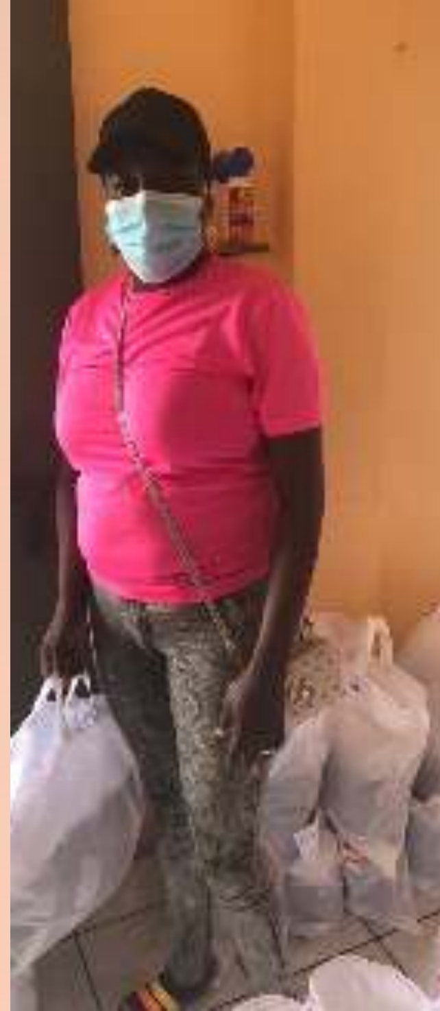
Care packages prepared and distributed to the vulnerable

We will continue as a Women's group to do ministry to the women of the Caribbean and beyond. We pray that God will continue to use us to bring the women of the Caribbean together.