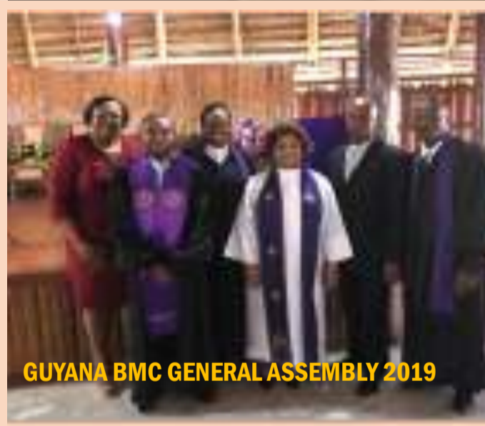
GUYANA BMC GENERAL ASSEMBLY 2019