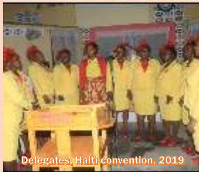
Delegates, Haiti convention, 2019

disappeared from the roster. Among the more productive were the following: