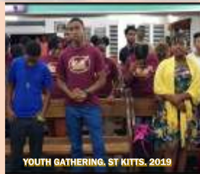
YOUTH GATHERING. ST KITTS. 2019