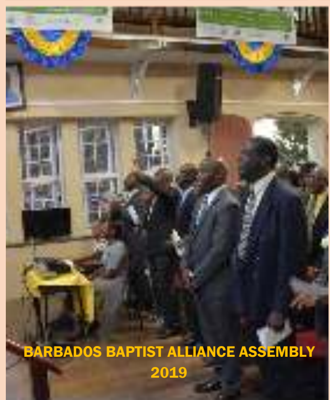
BARBADOS BAPTIST ALLIANCE ASSEMBLY 2019